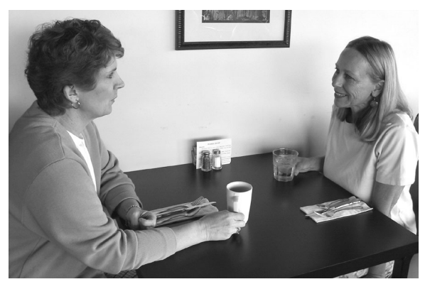
Talking with supportive friends and family members can be a successful strategy in coping with burnout.