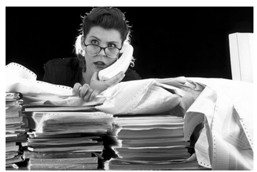
Awareness is the first step in counteracting the effects of burnout.

If you answered yes to more than five of these questions, you may want to take steps to counteract burnout.