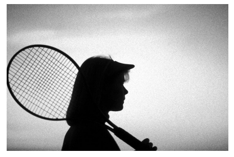
Racket sports requiring focused concentration may help give confronters a break from stress and worry.

Confronters often experience more anxiety than escapers, and may have a hard time letting go of control when situations call for it. You may try writing down your worries, then setting them aside. Assign a time to "fret," giving yourself a limited time to think about the problem and possible solutions. You already may be aware of the knots in your stomach or neck, so activities like racket sports or painting where focused concentration is needed may be better for you than meditative activities like running or yoga. Deeper and more focused types of bodywork may work better for you than an overall full-body massage.