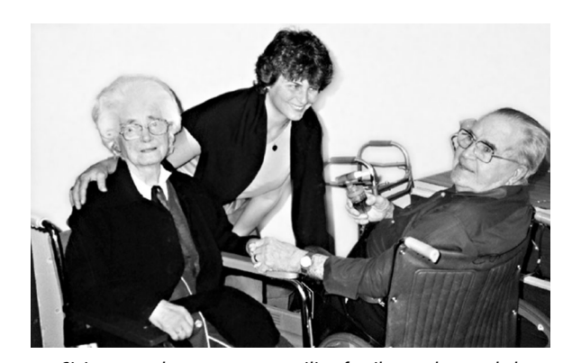
Giving a gentle massage to an ailing family member can help relieve pain and anxiety.

Caring touch can be a blessing for someone who is very ill or frail. Being in that condition almost always means the loss of control over one's life and can leave a person feeling quite alone and disconnected. Touch given by someone who cares can help meet the need for human involvement and provide an antidote to the needle-pricks, prodding and poking of medical procedures. Pain and anxiety may fall away as a person shifts his or her focus to the simple pleasure of soothing touch. Simple massage moves can even help relieve pain when medication has reached its limitations.