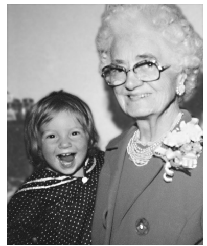
Caring touch benefits both elders and children, those giving as well as receiving.

Studies by the Touch Research Institute of the University of Miami Medical School have demonstrated that premature babies who were massaged gained more weight, were more active and alert, and stayed in the hospital fewer days than infants who weren't massaged. The results were the same with babies of cocaine-addicted mothers. In fact, it is now understood that most drug-exposed babies, including those with fetal alcohol syndrome, are capable of leading normal lives if raised in a nurturing environment that includes loving touch. And